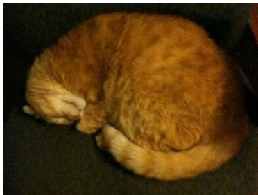
Chester likes to curl up and dream of mischief.