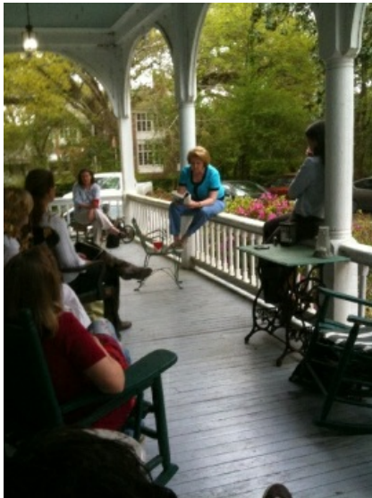
Areading at Termite Hall.