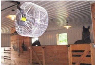
The horses chilling out in this unbearable Southern heat.