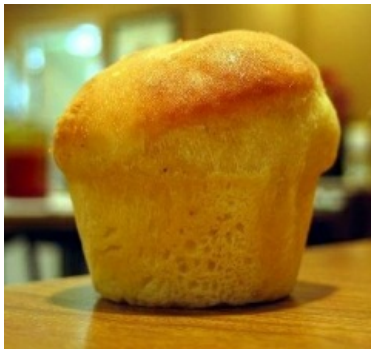
Ya'll want to do a cookbook together? You're on! More details in the future.