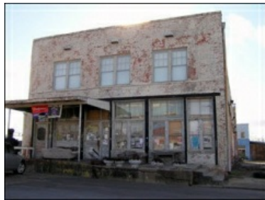
We're going to rock this joint, baby.