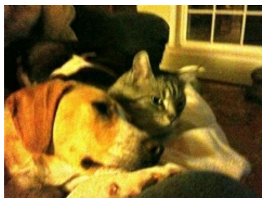
That's what friends are for.