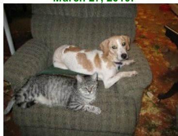
Merle Haggard (cat) and Sorrow (dog) commune in bliss