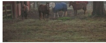
Foggy morning at Casa Caroline