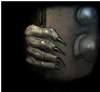
What are you going to do with your leftover Halloween candy?

So happy to announce that SKIN DANCER is now available in both the Amazon Kindle Store and in Barnes and Noble's NookBook Store.