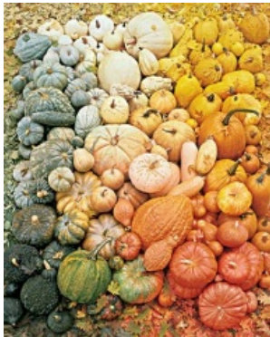
Autumn is my favorite season. Aren't these gourds simply stunning?