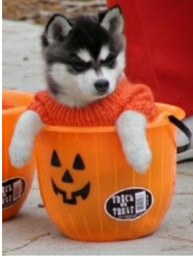
Did everyone have a spooky and safe Halloween?